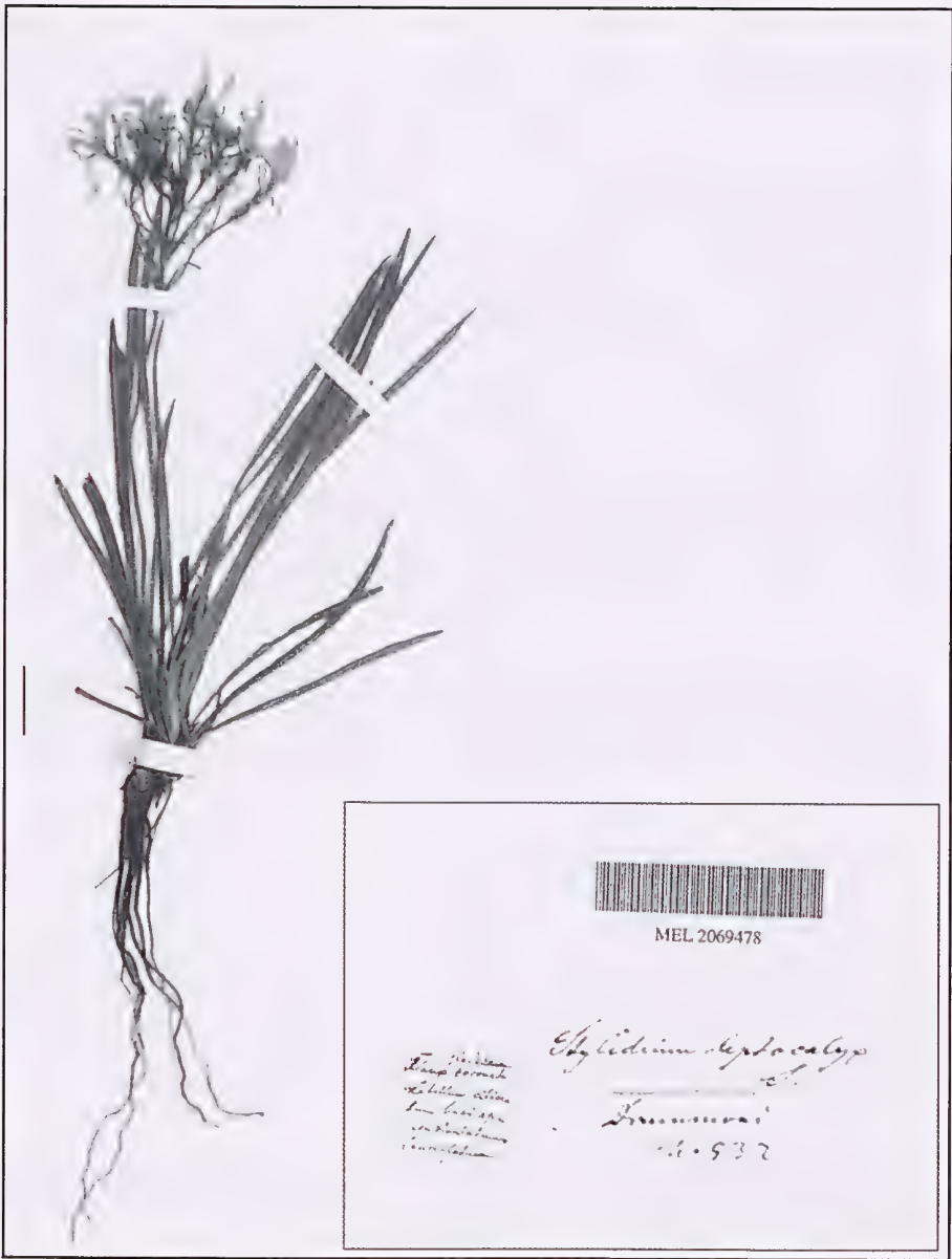
Figure 1. Lectotype of Styloidium leptocalyx (MEL 2069478). Scale bar at 1cm. Inset shows label details, with Sonder's annotation on the left.

Notes. In addition to differences in geographic distribution, Styloidium leptocalyx can be clearly separated from S. stenosepalum on account of its shorter corolla tube, shorter column, and corolla lobes that are pink and bear two sets of dark pink throat markings rather than creamy-white and with one set of throat markings. The relative size of the corolla lobes also typically differs between these species: in S. leptocalyx the posterior lobes are roughly equal in size to the anterior lobes, whilst in S. stenosepalum they tend to be slightly shorter. Sterile material can be identified with some confidence given the leaves of S. leptocalyx are usually broader than in S. stenosepalum , and bear slightly longer leaf papillae. Differences to S. scabridum are discussed under the notes for that species.